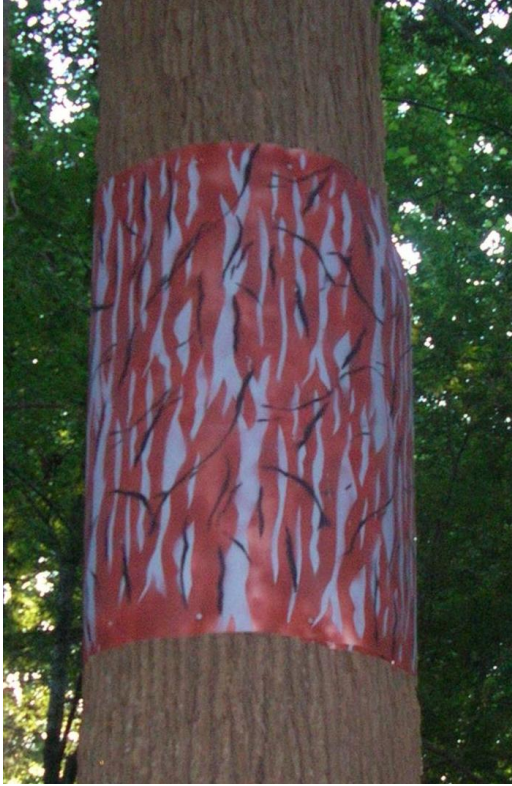
Figure 2. Snake excluder device (SNED) \geq 0.9 m tall wrapped around and stapled to trunk of a Mississippi Kite nest tree.