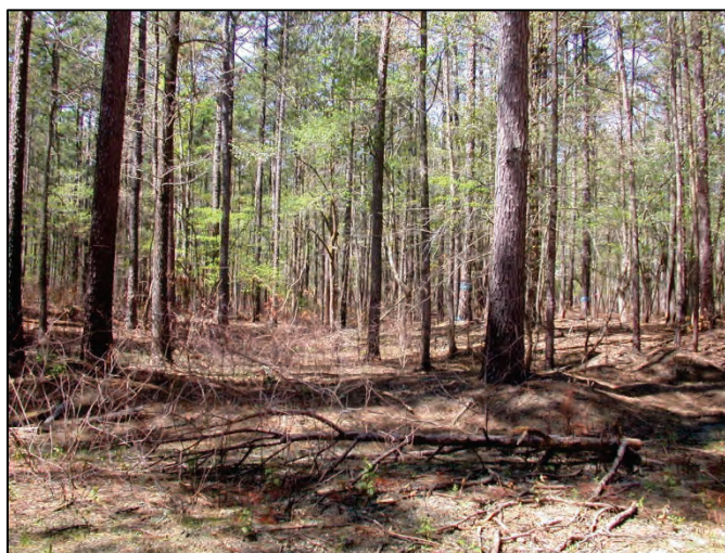
Untreated flatwoods at Kingsland Prairie Preserve

Chief of Research Arkansas Natural Heritage Commission 323 Center St., Suite 1500 Little Rock, AR 72201 (501) 324-9761; billh@arkansasheritage.org