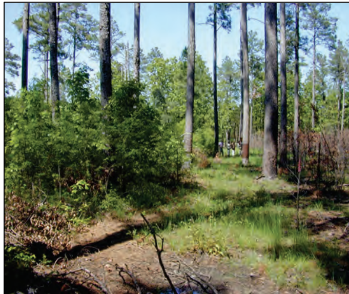
Untreated and treated flatwoods at Pine City Natural Area

The historical flatwoods were much more open than they are today at the protected areas (PCNA, KPNAP, HCBNA, FWP), highlighting the need for fire—the most important ecological process maintaining the distribution, composition, and diversity of this system. Decades of fire suppression prior to state and private conservation ownership at these four sites altered species composition and structure, resulting in dense forest stands. Portions of three sites (KPNAP, HCBNA, FWP) were converted to industrial pine plantation.