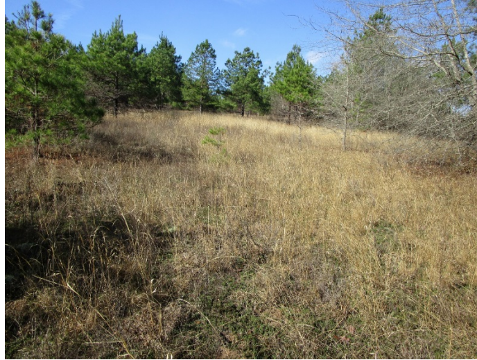
Sandhill Grassland Restoration Area

Project Title: Implementing Phase IV State Wildlife Action Plan Strategies in the West Gulf Coastal Plain Sandhill Oak -Shortleaf Pine Forests and Woodlands to Benefit AWAP Species of Greatest Conservation Need