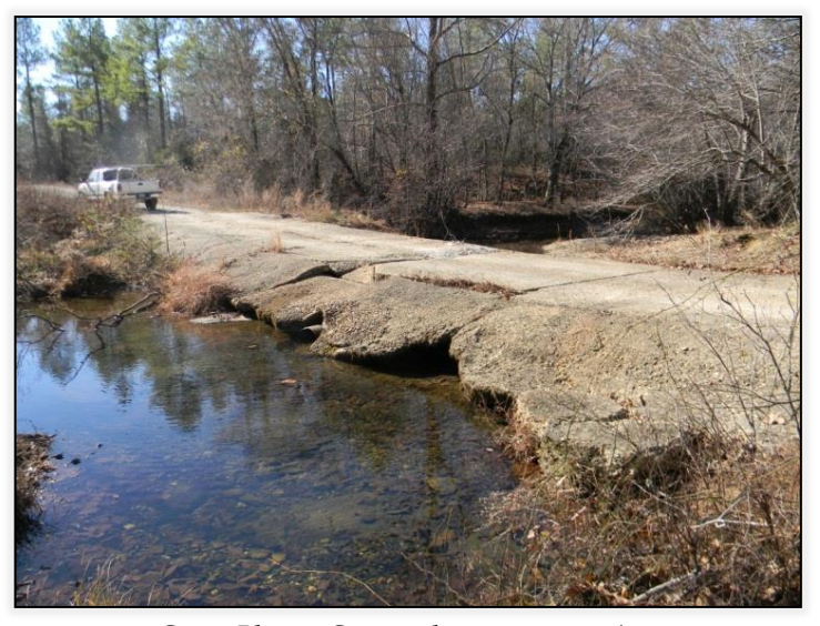
Cover Photo: Current low water crossing

mjenks@tnc.org Tel. 501-614-5086 Fax 501-663-8332 The Nature Conservancy 601 N. University Ave Little Rock, AR 72205 January, 2014