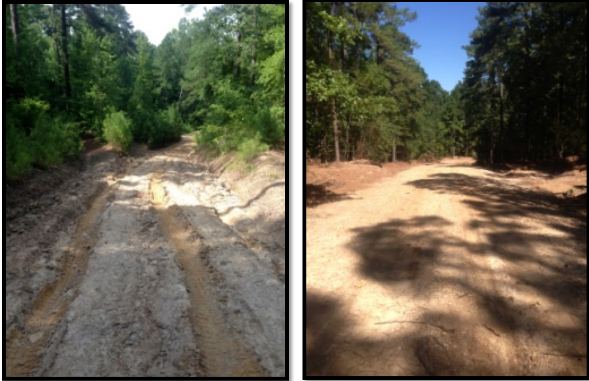
Figure 1: Scott Story Road Restoration; before and after restoration.