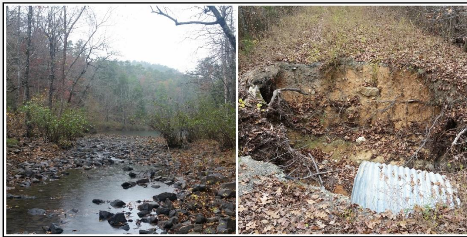
Cover Photo: Left, Alum Fork Saline River. Right, eroding stream crossing to be stabilized.